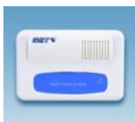
Relay Module C-9302A