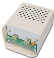
LD-8321 Loop relay