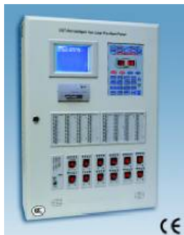
GST500 Fire Alarm Panel