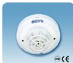
I-9103, I-9103R Heat Detector