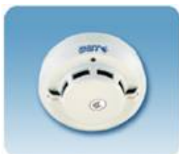
I-9101 Multi-sensor Detector