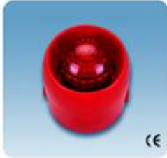
I-9403 Sounder and Strobe