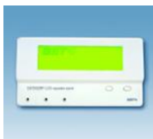
GST852RP LCD Alphabetic Repeater