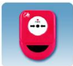
I-9201 Manual Call Point