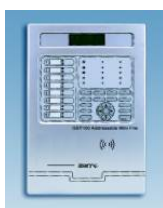
GST100 Fire Alarm Panel