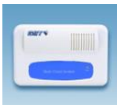
I-9319 Zone Monitor