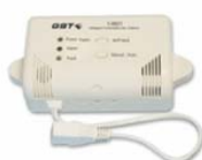
I-9602LW Gas Detector