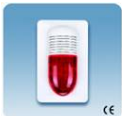
I-9401 Sounder and Strobe