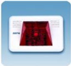
I-9314 Strobe Lamp