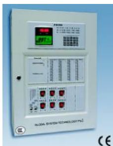
GST200 Fire Alarm Panel