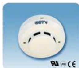
I-9102, I-9102R Optical Smoke Detector