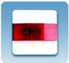
C-9314P Remote LED Indicator