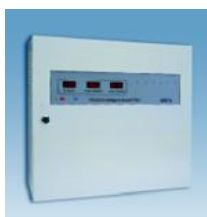
PSU24-6, PSU24-6A Power Supply