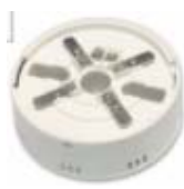
C-9502 Base mount loop isolator