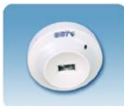
I-9104 Flame Detector