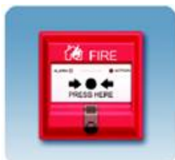
I-9202 Manual Call Point