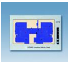
GST8903 Graphic Annunciator