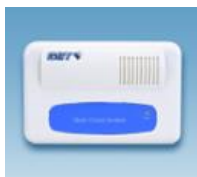
Input Module I-9300