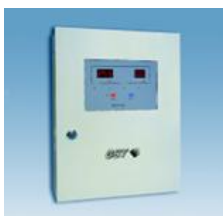
PSU24-3, PSU24-3A Power Supply