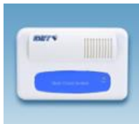
Input/Output Module I-9301