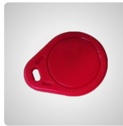
Keyfobs: Tags may be hang with a keychain, and can be customized at your request.