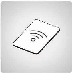
Reusable low cost guest keycards: Cards may be customized at your request.

Guests: Wristband for guest convenience and all-inclusive. Staff: Special printing long lasting staff keycards. VIP guests: Wristbands or keyfobs.