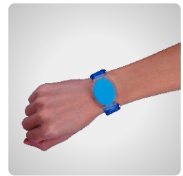
Wristbands: The wristbands can be used for 'all-inclusive' resorts and spas.