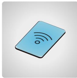
Special printing long lasting staff keycards: Cards may be customized at your request.